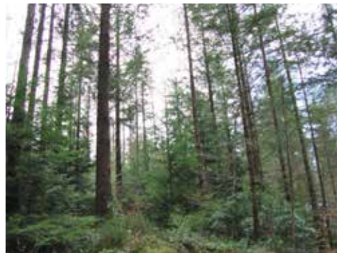
Natural regeneration in Spruce under CCF transformation. Knockrath, Co Wicklow.