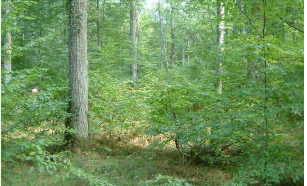
CCF management in broadleaved forest.