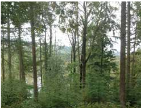
CCF management in Baronscourt, Co Tyrone.