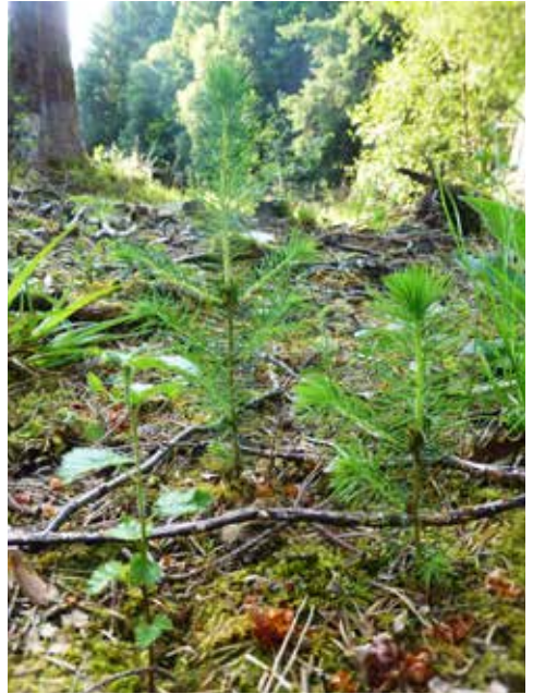
Group harvesting in Sitka spruce with onset of natural regeneration. Raheen, Co Clare.