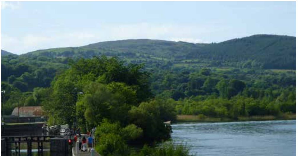
Forests fulfil a wide range of services (water protection, landscape, biodiversity) important to society well-being, Co Clare.