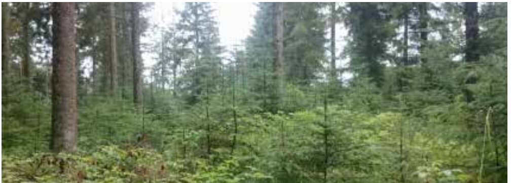
Natural regeneration in Spruce CCF/ timber production system, Clocaenog, Wales.