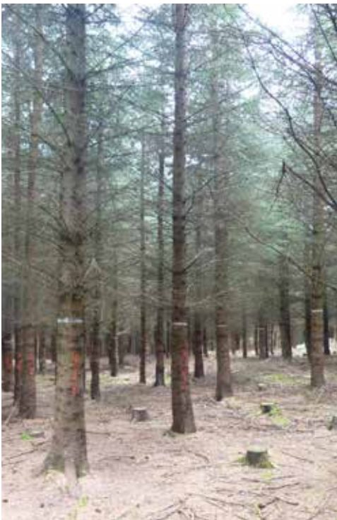
Selective thinning in CCF transformation showing better quality trees (marked in white) and stumps of removed competing trees, Ballycullen, Co Wicklow.

Stand stability is an important factor in considering transforming to CCF. It is not an option for all sites as issues with elevation and soil quality might undermine forest wind stability during the transformation.