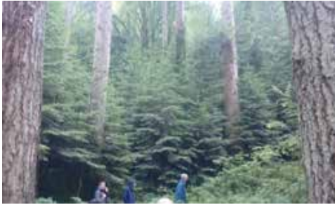
Natural regeneration in high quality Douglas fir stand, Wales.